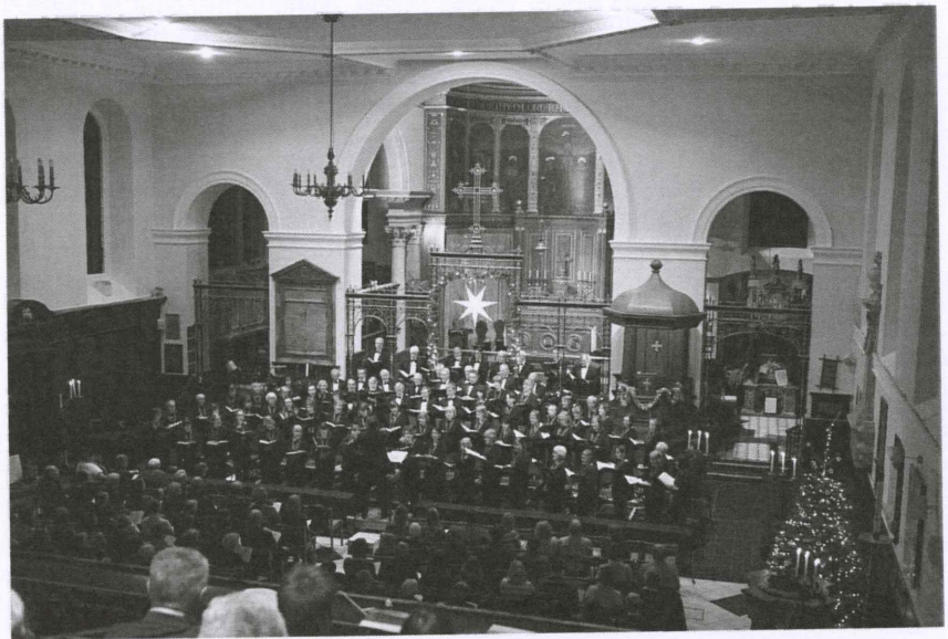
The Mayor of Guildford's Christmas Concert in Holy Trinity Church