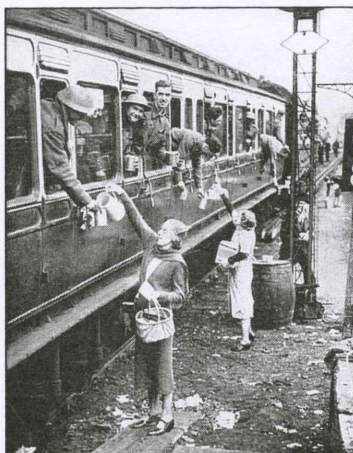
Helping with Dunkirk troop trains

In the 1960s, the Rotary Club of Guildford played a significant fundraising role to establish the Yvonne Arnaud Theatre and in 1965 the Club successfully lobbied government departments to establish the University of Surrey in Guildford the following year.