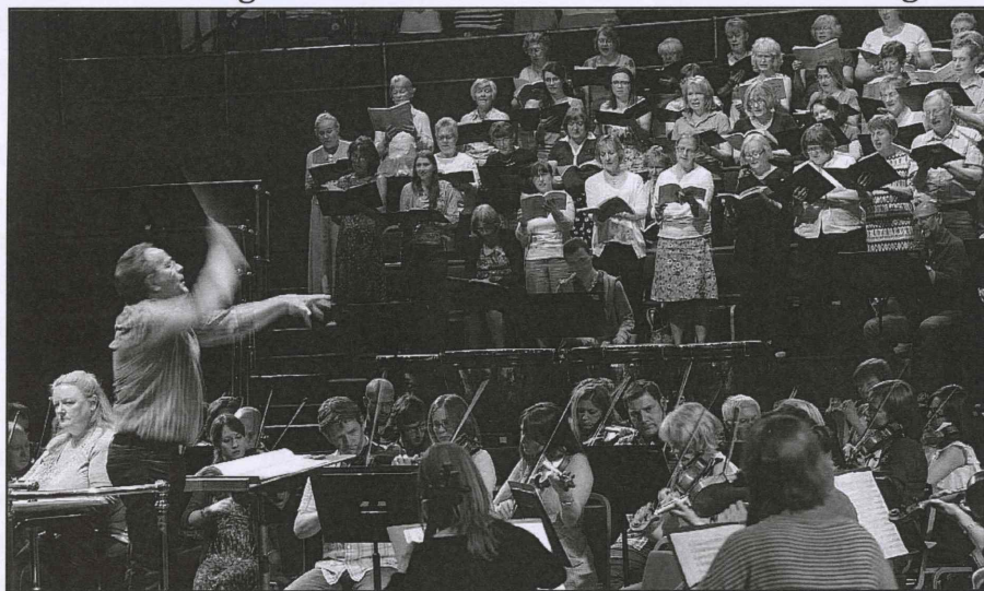
Rehearsing in the Royal Albert Hall

The Vivace Chorus is a flourishing and adventurous choir based here in Guildford, Surrey. We have two aims: to make music of the highest standard and to have fun while doing so.