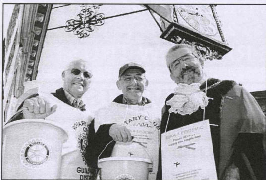
The Mayor helps with the Ebola Fundraising

In September, thousands of people in West Africa died after contracting the Ebola virus and members from all three Guildford Rotary Clubs were out in Guildford High Street collecting money for our Ebola appeal. This deadly disease is spread all too easily through daily human contact and so far our Rotary Clubs have collected over £6,500 for the purchase of water buckets, enabling people to wash their hands in clean water and thereby reduce the spread of infection.