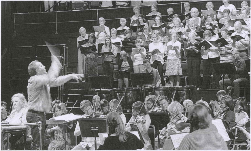
Rehearsing in the Royal Albert Hall