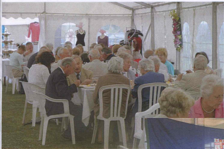
The Summer lunch at Lukyns