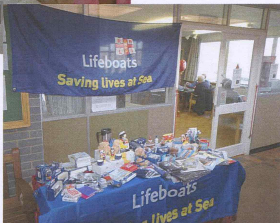
Our souvenir sales desk