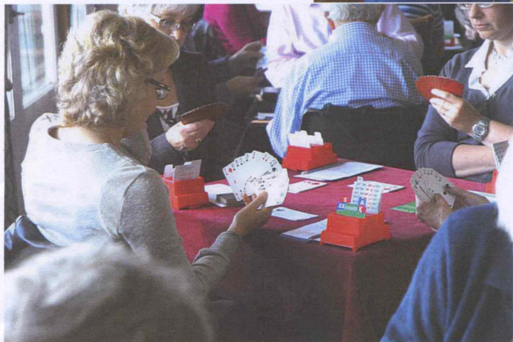
A serious moment during our Bridge tea