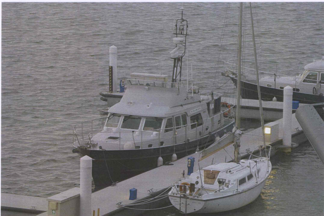
The Quay at RNLI Headquarters, Poole

The North Sea String Quartet was founded in 2008 at the Royal College of Music. They have performed at venues in London and around England including Cadogan Hall, the Lake District Summer Music Festival and chamber music festivals at the Royal College of Music. The North Sea String Quartet has performed in masterclasses with members of the Chilingirian Quartet, Quator Ebene and the Endellion Quartet, to name but a few. When not performing as a quartet, the players all have freelance orchestral careers, and have individually performed with orchestras including the Royal Philharmonic Orchestra, Royal Liverpool Philharmonic Orchestra, Northern Sinfonia, and City of Birmingham Symphony Orchestra.