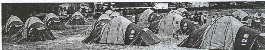
A tented village of temporary homes sent to help Asia's Tsunami victims

Projects initiated by the Rotary Club of Guildford in more recent years have included the construction of three dams to bring clean water to local communities in Kenya; financial support for Rotary International's worldwide campaign to eradicate Polio and its Jaipur Limb project in India.