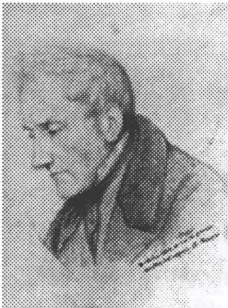
Alessandro Manzoni To whom Verdi dedicated the Requiem

Despite Verdi's best efforts, his plan fell through. By then he had already completed the Libera Me movement, but during 1869-70 he left the Requiem project aside, turning his attention instead to Aida , which he completed in 1871. His next composition was a string quartet, which was finished in March 1873. Two months after this came the news of Manzoni's death, which came as a terrible blow to the composer.