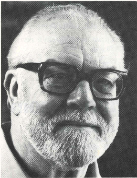
Sir Charles Groves

Charles Groves was born in London and spent his boyhood as a chorister in St Paul's Cathedral.